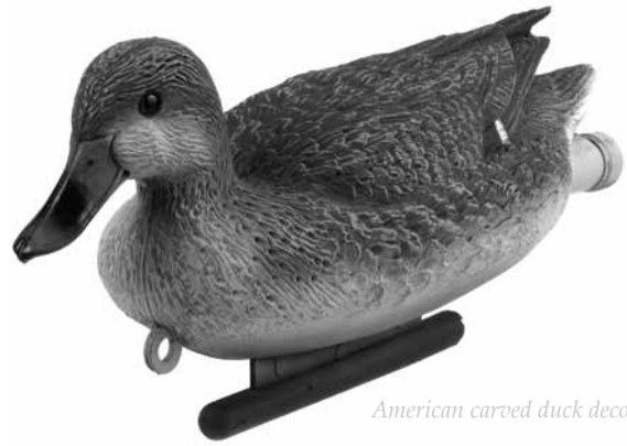
American carved duck decoy